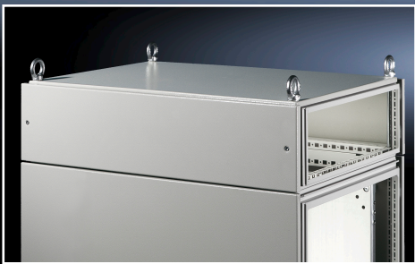
Open bottom design